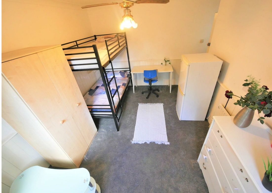
25 Spencer Road , Bournemouth, BH1 3TE